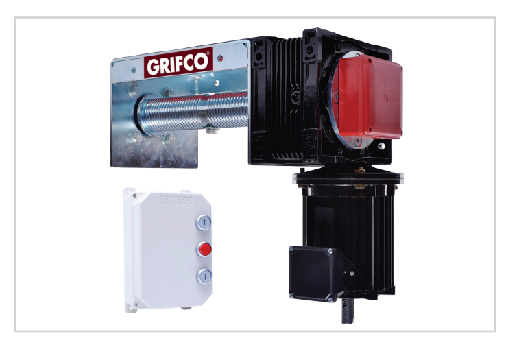
Product may differ slightly from image shown.

Direct Drive Cable Winch with Individual Wall Control