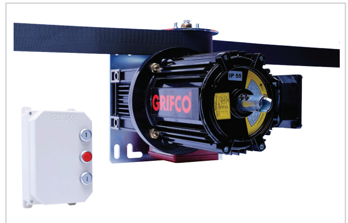
Product may differ slightly from image shown.

Direct Drive Belt Winch with Individual Wall Control