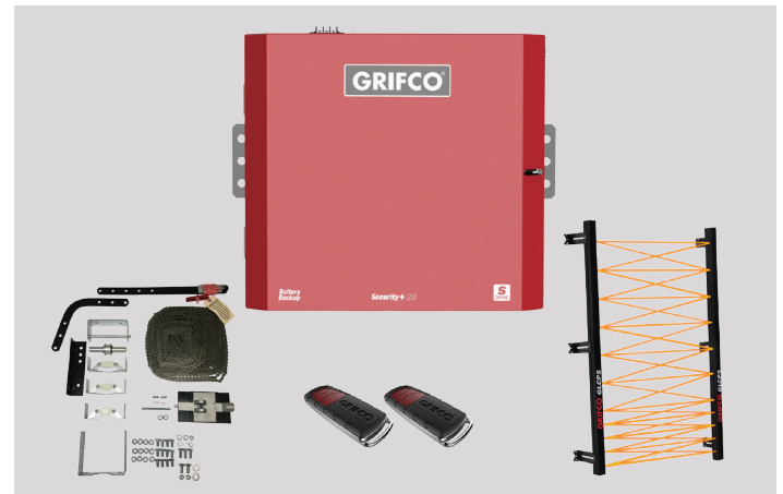
Product may differ slightly from image shown.

Commercial Door Operators / Sectional Door Operator / S-Drive