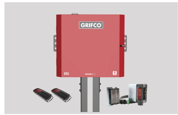
Product may differ slightly from image shown.

Commercial Door Operators / Sectional Door Operator / S-Drive