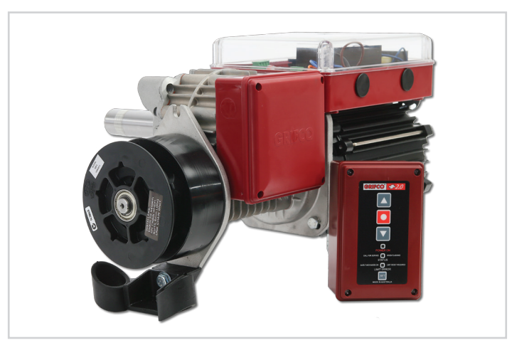
Product may differ slightly from image shown.