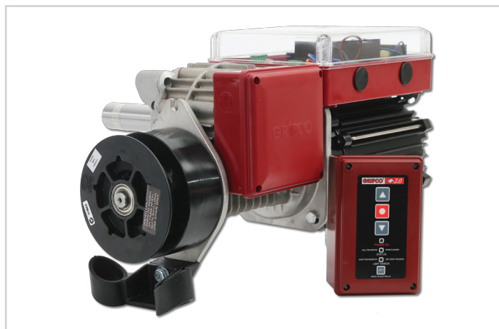
Product may differ slightly from image shown.