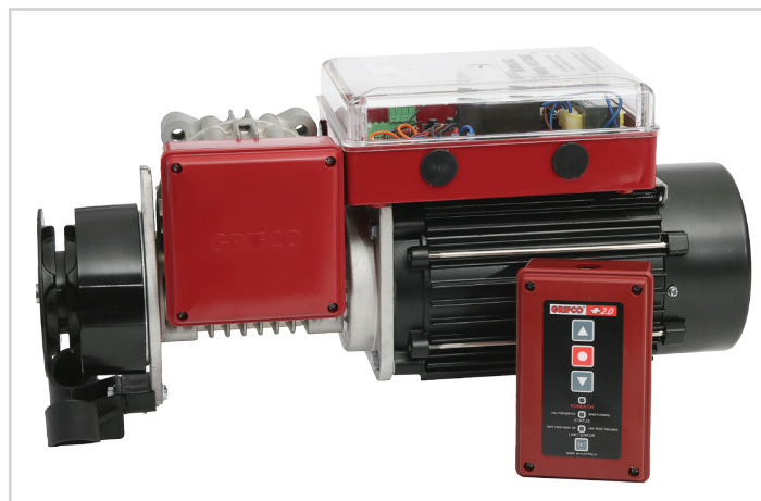
Commercial Door Operators / Roller Shutter Operators / eDrive +2.0