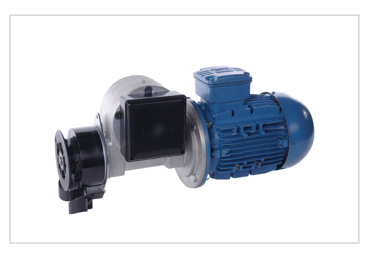
Product may differ slightly from image shown.