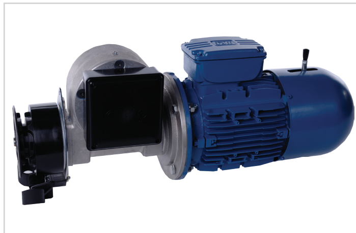
Product may differ slightly from image shown.