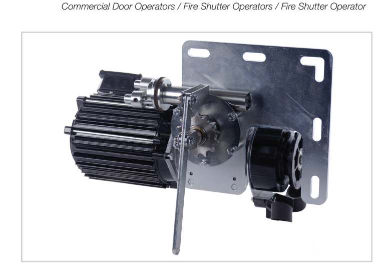
Product may differ slightly from image shown.